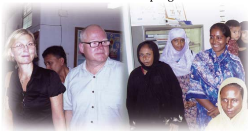
RFSU team visited to BAPSA clinic at N oakhali.

The team also visited the high officials of Sida, Save the Children-Sweden-Denmark office in Bangladesh, Family Planning Association of Bangladesh- a sister concern of IPPF in Bangladesh, Marie Stopes Clinic Society and Bondhu Social Welfare during their tour.