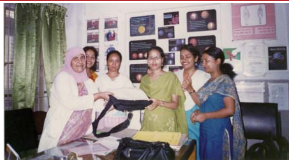
A partial view of certificate giving ceremony

Training of the 6th batch will be held in three centres of RHSTEP at Dhaka Medical