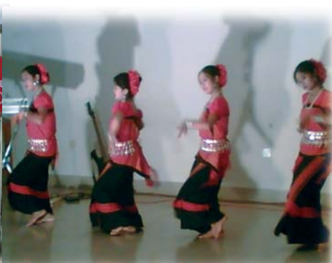
RHSTEP clinic at Bandarban Sadar Hospital and the performance of cultural show at clinic launching ceremony