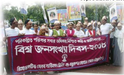
Participants in the rally on World Population Day 2008

To mark the day in a massive way and to reach out the people, RHSTEP and BAPSA organised different activities through its clinics at different places like Comilla, Faridpur, Dinajpur, Rajshahi, Mymensingh, Rangpur, Bogra, Chittagong,