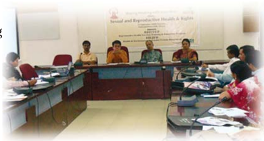
The Executive Director of RHSTEP was inaugurating the meeting

The media has to play a vital role in ensuring sexual and reproductive health rights as it influences all sectors of the society starting from family life to the national life in the long run. Participating journalists said this at a discussion on 'Sexual and Reproductive Health and Rights in Bangladesh' held at National Press Club Conference Room in