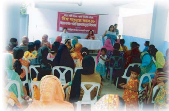
The facilitator was conducting the session on breast feeding and its importance.

The discussion emphasised this and conveyed the message: The facilitator was empower women about their own right, and impart information to other women. Besides, antenatal check-up, hospital delivery, complication of home delivery, colostrums feeding were also highlighted during the programme. The participants highly appreciated the programme and